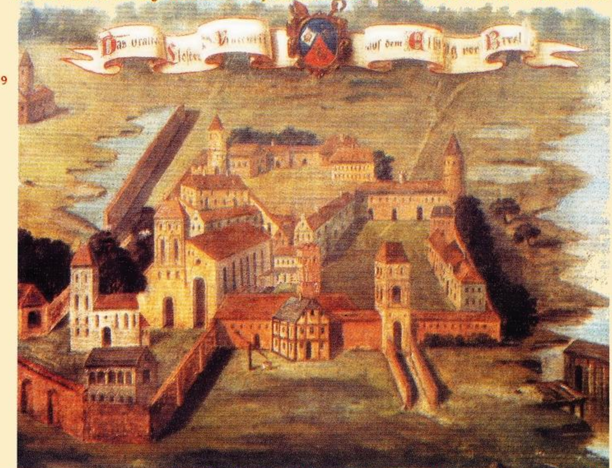
The most magnificent sacral complex founded by Peter Wlastowic on his Slezan heritage land Olbin. St Vincent Abbey of 1139. Under false pretences of a fight against Turks, who never entered Silesia, demolished by Lutherans within one month starting on 14 October 1539.