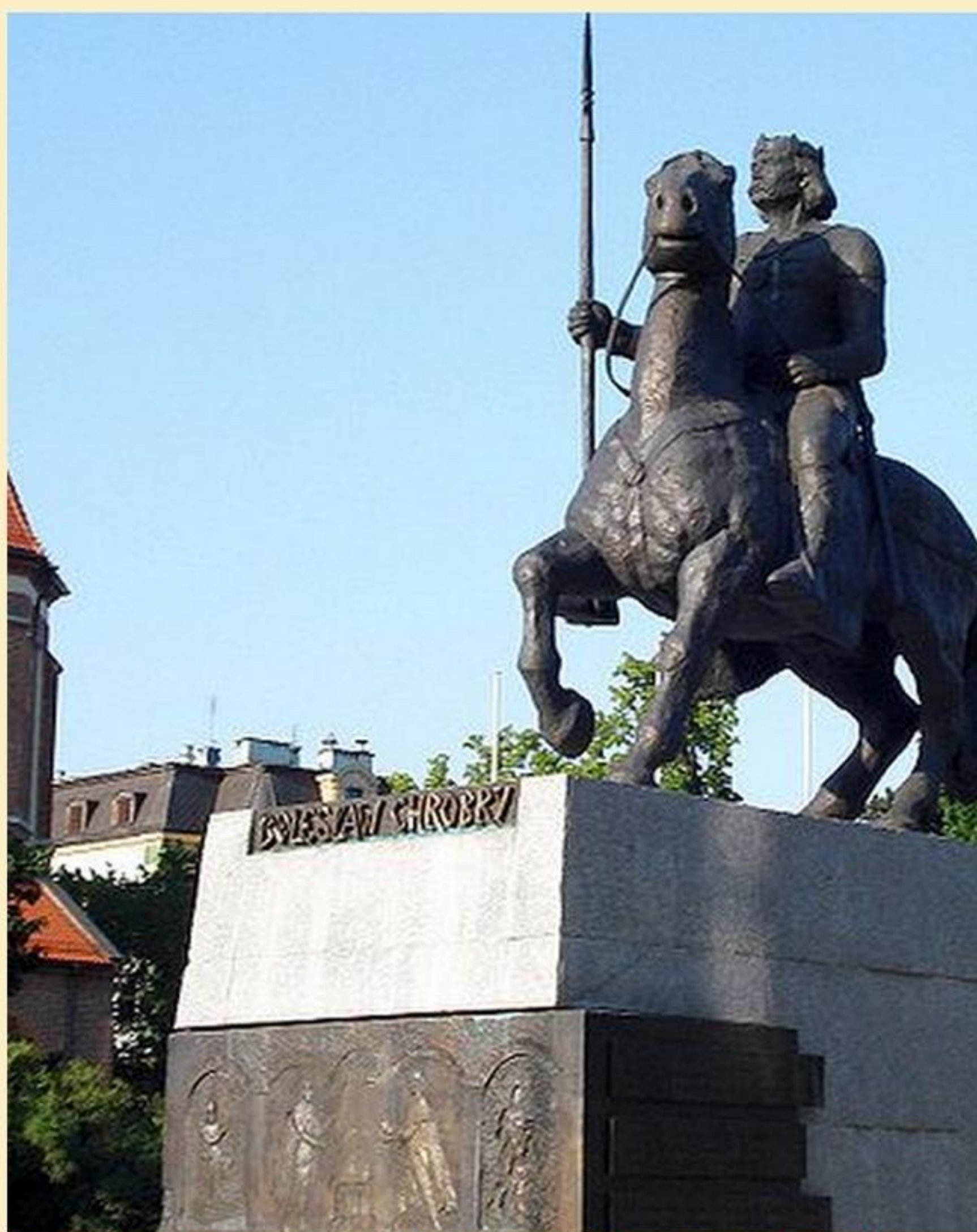
Boleslaw the Brave, king of Poland, the greatest benefactor in Wroclaw history. At the crossroads of north-south (Amber Road) and west-east (High Road) trade routes, the Slezans' prince Wroclaw (Wratislaw) established fortified settlements on Odra river islets, named after him Wroclaw (Wratislawia, Wratislavia). By the end of the first millennium AD, Wroclaw was enough important to be declared one of metropolises of the medieval Europe, as thanks to Boleslaw the Brave, the first king of newly created Christian Polish state, at the Congress of Gniezno, in the year 1000 AD. Wroclaw became one of four seats of Roman Catholic bishops in Poland, the other three were in Krakow, Poznan and Kolobrzeg.