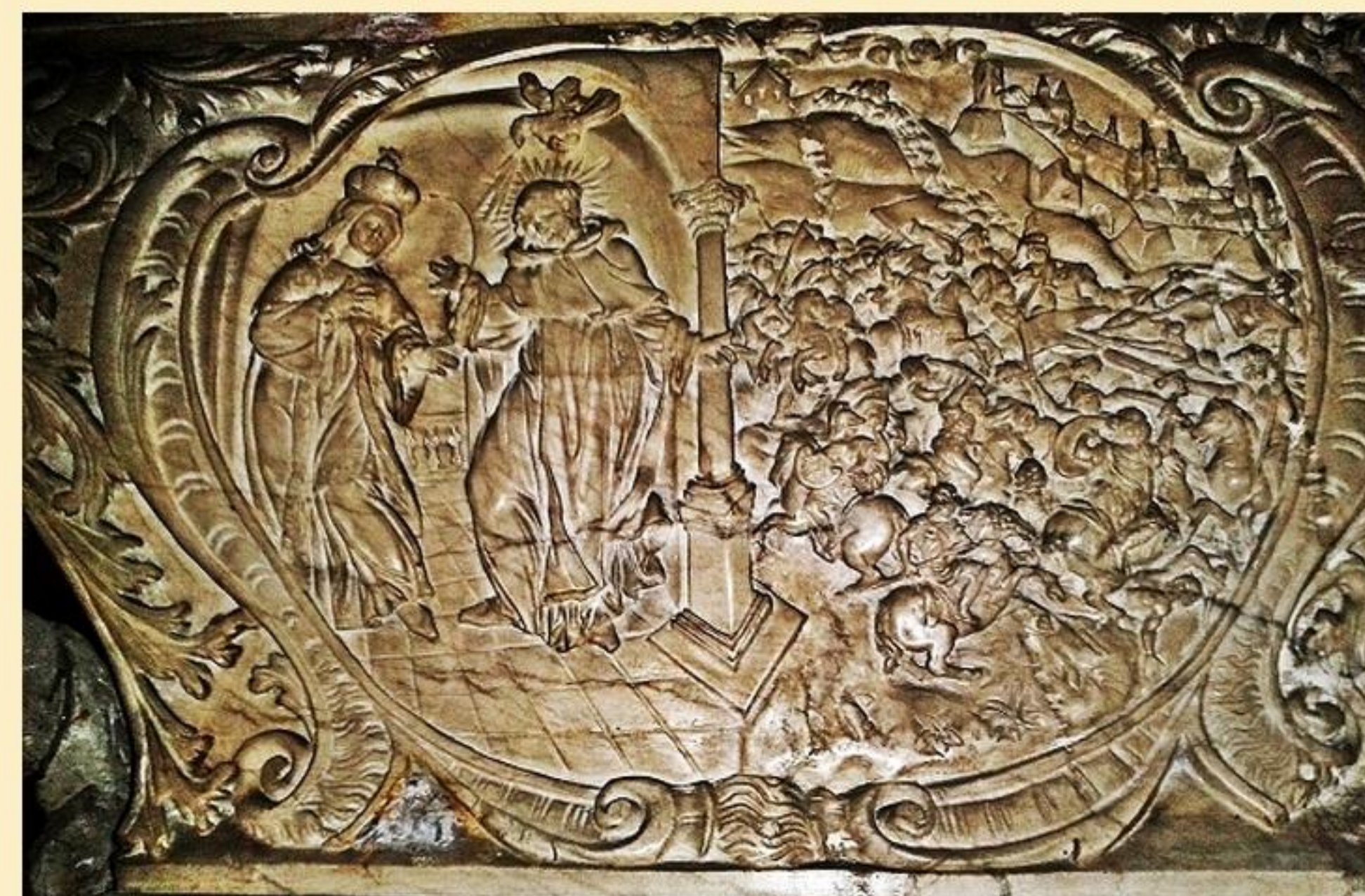
Blessed Caslaus OP, the Roman Catholic patron of Wroclaw, a Dominican monk of such a strong faith that during a Mongol invasion of Europe, which was stopped in Battle of Legnica reportedly attempted to convert the invaders to Christian faith, with fervent prayers saved a substantial part of Wroclaw, and in spite of the defeat of Silesians under the command of prince Henry II the Pious who was killed under Legnica, the Mongols stopped their conquest in Europe.