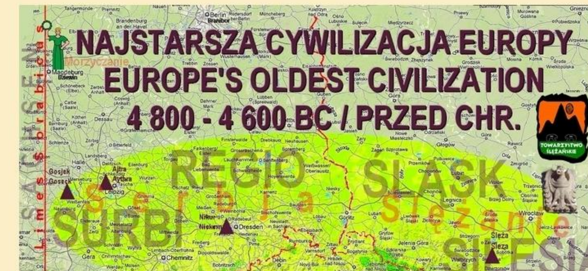
On the territory of the oldest Europe's civilization to the east of what was later named by the Germans 'Imes Sorabicus', over thousands of years emerged autochthonic nations of West Slavs. Only Poles and Czechs created their own states and survived the Drang nach Osten extermination. The fertile area that stretches from Mt Slez to the large Odra River Valley was a cradle of evolution for the West Slavic Slezans tribe.