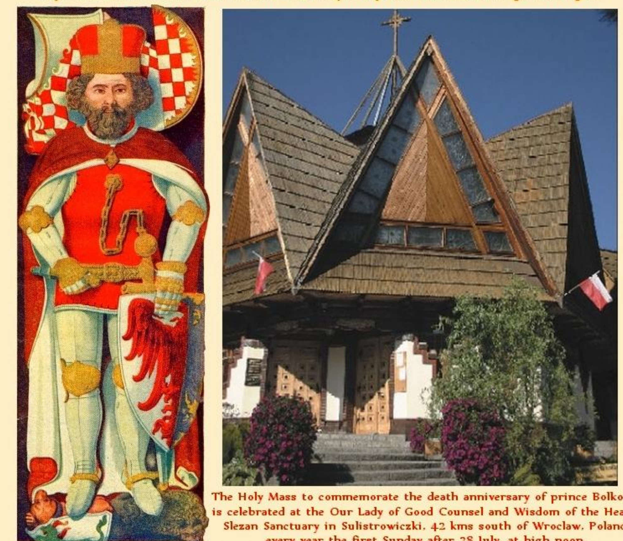
The Holy Mass to commemorate the death anniversary of prince Bolko II is celebrated at the Our Lady of Good Counsel and Wisdom of the Heart Slezan Sanctuary in Sulistrowiczki, 42 kms south of Wroclaw, Poland every year the first Sunday after 28 July, at high noon.